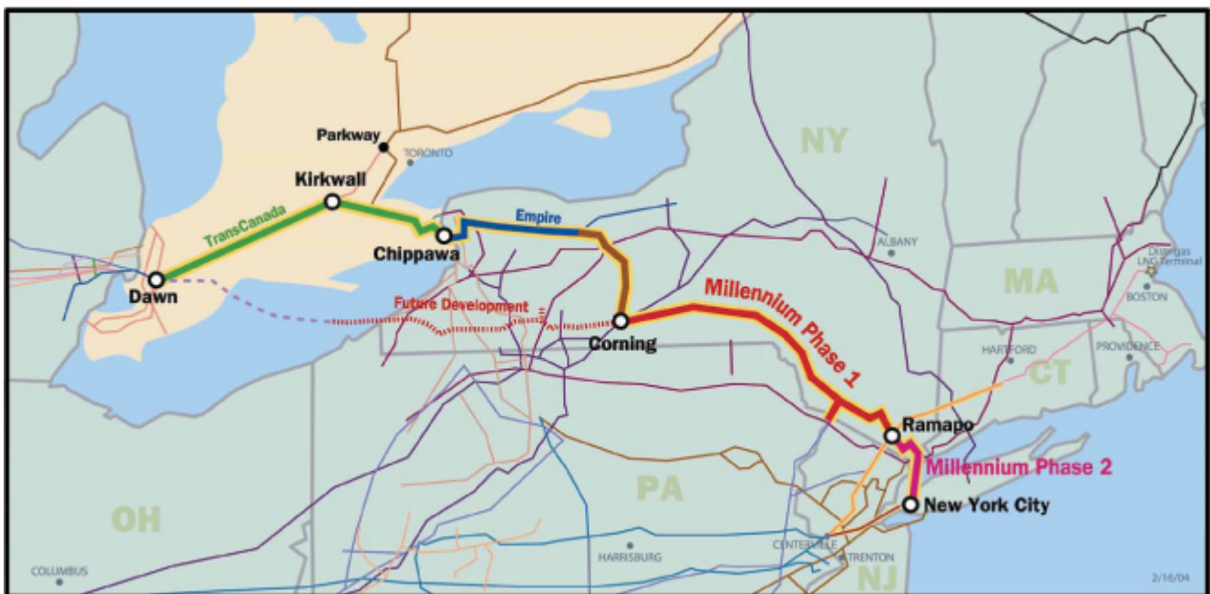
The proposed Millennium Natural Gas Pipeline would wind its way across New York state into Ontario, Canada.

Will cross the Hudson River, linking to the New York City metropolitan market. In-service date has not been set.