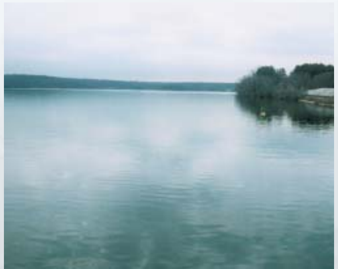
Kensico Reservoir provides water to millions of New York City residents to the south.