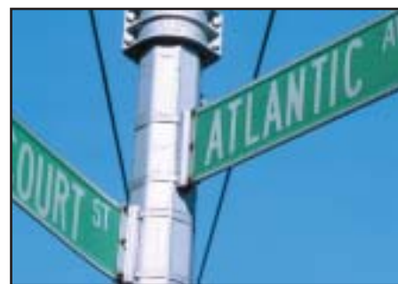
The corner of Court Street and Atlantic Avenue in Brooklyn is the site of a groundbreaking organizing effort for Concrete Laborers.

"I am proud to be involved with such a great group of workers and