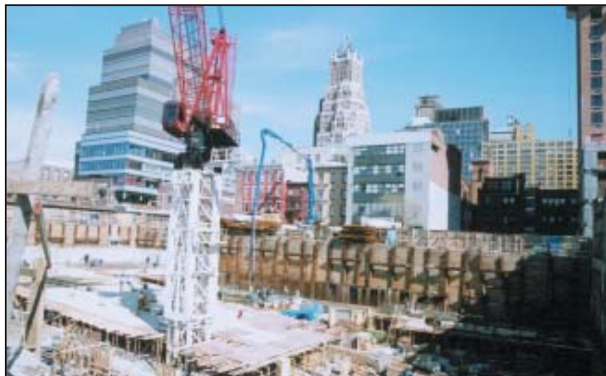
Concrete Laborers work on a parking garage that will sit below an 18-story building when completed.