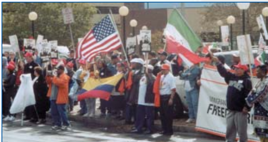
Social justice – Local 210 members displayed their solidarity with other building trades members and the Freedom Riders, who are waging a battle for social justice for millions of immigrants.