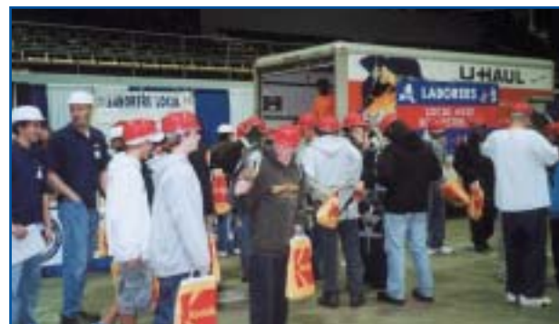
Career-driven – Students from throughout the Rochester area visited the Monroe County Dome Arena to learn about careers in construction.