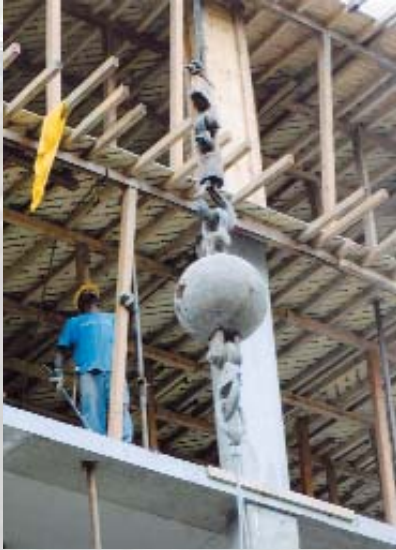
Laborers are successfully targeting the growing affordable housing market in New York City.

This lucrative construction market traditionally has been completed by non-union labor with a technique that uses block walls and pre-cast planks, effectively squeezing skilled union cement and concrete workers out of the running for jobs.