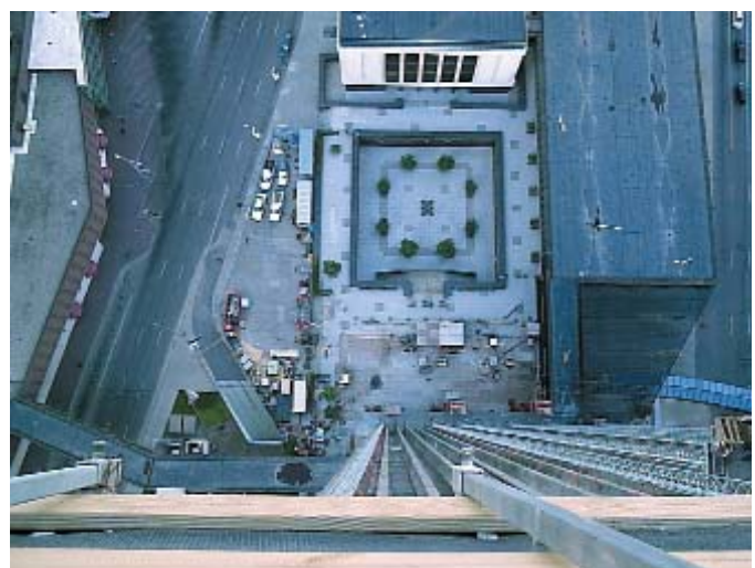
Laborers know first hand the value of Structural Preservation System's corporate safety program.