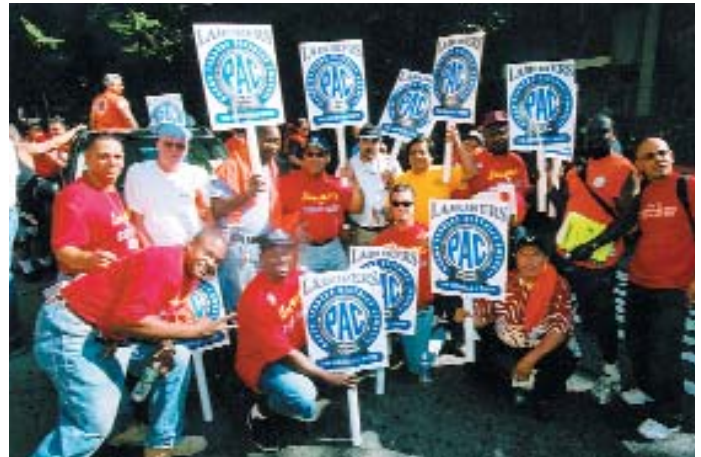
LIUNA members in New York City were among those who came out in force to make workers' voices heard in the first presidential election of the century.