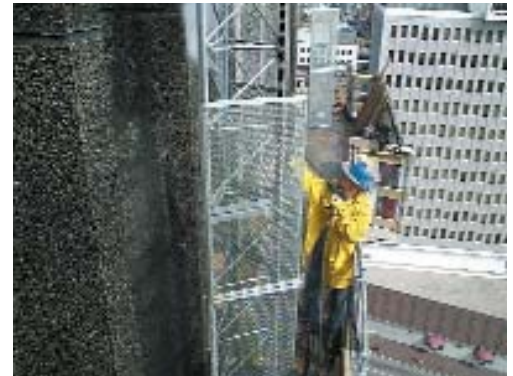
Laborers are working triple shifts on the building's façade in order to complete the project by fall 2005.

"I was impressed with the procedures that Structural put in place for each individual worker," he said. "There is truth to the statement that their objectives are not just 'all talk.' They have the program in place and a set of checks and balances that other jobs around the state should use as an example." 🌄