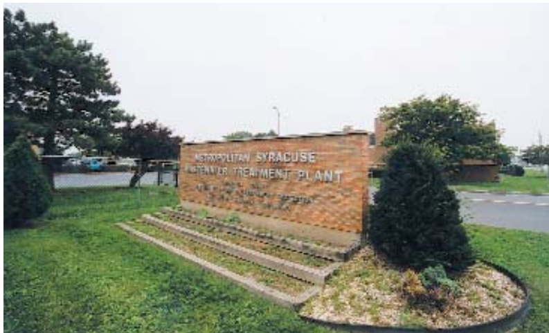
Laborers in Central New York have been using their skills to restore the health of Onondaga Lake. The lake's history of domestic and industrial pollution has seriously degraded its water quality and affected usage over the years.

During the first phase, members were required to participate in hazardous waste training because of the contaminated working conditions at the antiquated Hiawatha plant. The NYS Laborers' OSHA-approved training programs and skilled workforce were a major plus for the contractors, who agree that the 80-hour courses guarantee them