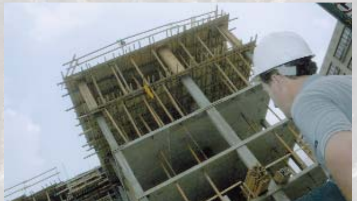
The 100th Street project is a prime example of how union labor represents quality workmanship and professional expertise.