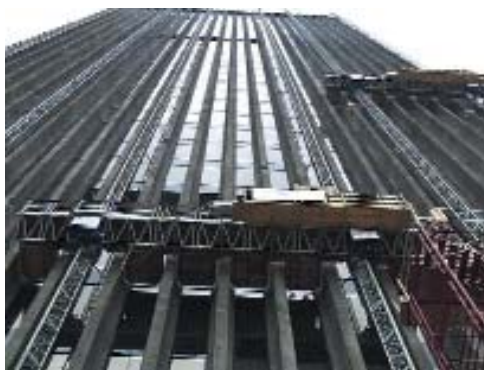
Able to lift up to 4,000 pounds, this climber was the machine of choice for the Xerox façade project.

Structural Preservation Systems, Inc. (SPS), the nation's largest specialty firm focusing on structural repair, maintenance, protection,