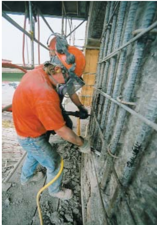
Local 633 members and their affiliated contractors kept motorists on the move while working on major bridge repairs. As expected, the project is right on schedule.

The I-81/690 work goes right through the center of the city, affecting thousands of commuters each day. The work is completed during the day and the bridge shut down