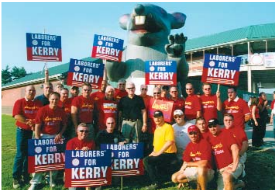
Laborers in Fishkill came out to support Sen. John Kerry.

The battle continues as Laborers and their allies continue to look ahead and map out plans for union members and other working family activists to continue the fight, even under tough conditions. The large, strong and growing movement for change will not be silenced as long as Laborers and the voices of working families are heard. ▀