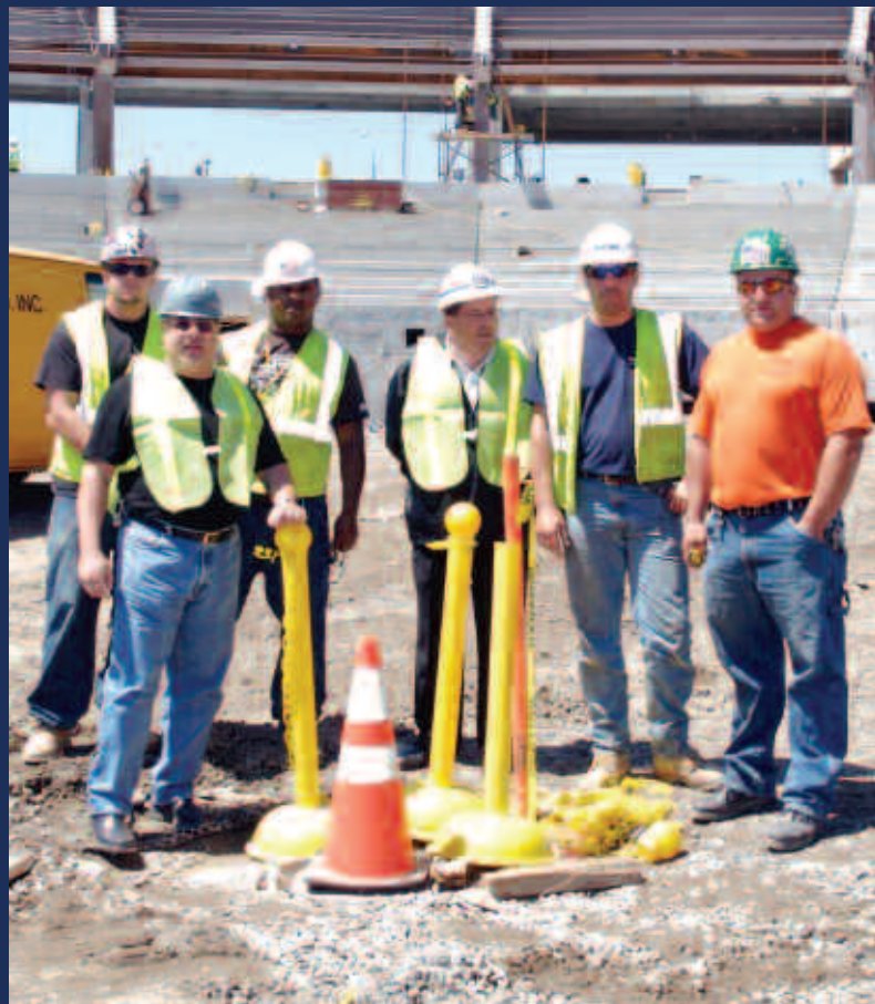
Safe at Home - Laborers proudly stand where home plate will be situated in the new Yankee Stadium.