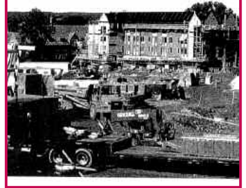
Cornell University – New dorms go up at Cornell University