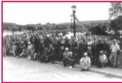
Octopus Project – Laborers in front of $30 million dollar project.