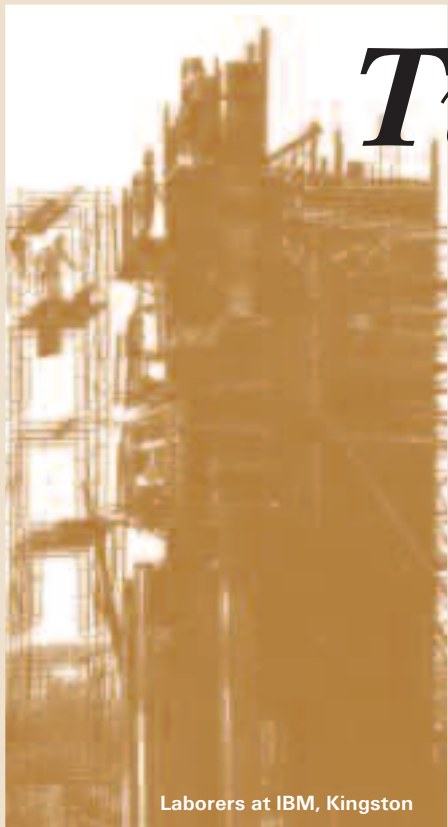
Laborers at IBM, Kingston

Formed by consolidating Locals 643, 27, 697 and 698, Laborers Local 17 has built major highways and important military facilities throughout the Newburgh region. The local began building at the U.S. Military Academy at West Point in the early 1940s, constructing a state-of-the-art science center, two large-scale function halls and the massive Michie Stadium and Arvin Gymnasium sports complexes.