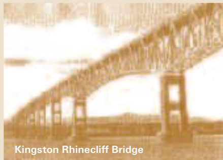
Kingston Rhinecliff Bridge