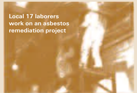
Local 17 laborers work on an asbestos remediation project