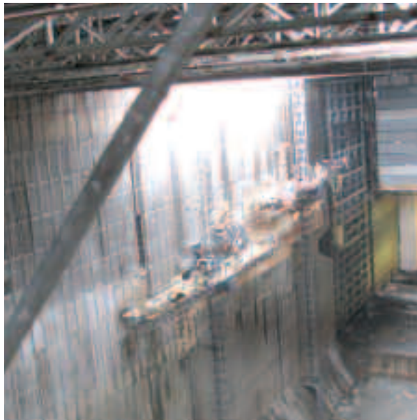
Local 322 members fight the cold to repair St. Lawrence Seaway locks.