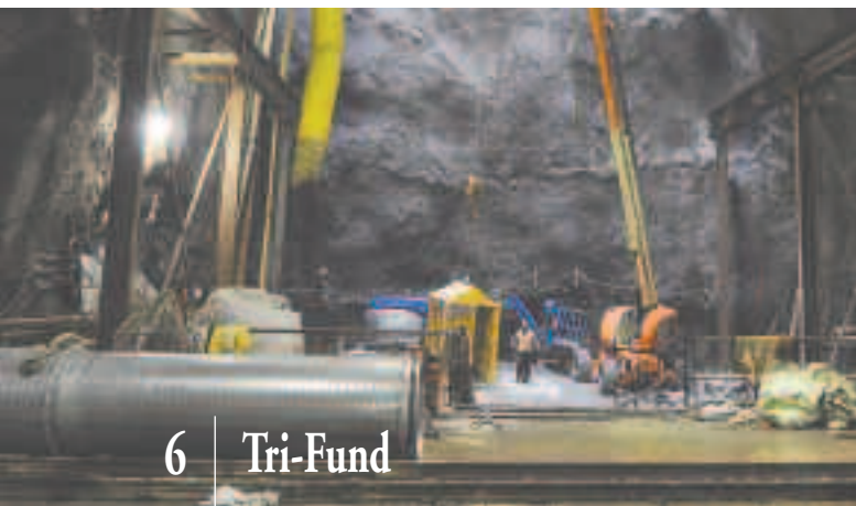
The "man cage," in top photo, carries Sandhogs down to the worksite. The key in-and-out system, center photo, keeps track of whether Sandhogs are at the surface or below. The Sandhogs carve an underground railway, bottom photo, this page, and both photos, facing page.

Some of the new work sandhogs are doing involves using new tunnel-boring machines. These machines, manufactured and tested in