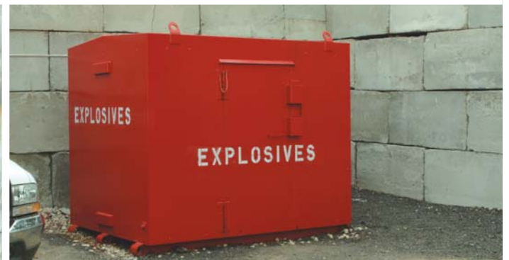
Moving Rock – Top: Members of Local 29 remove rock to create a hole as long as two football fields and several hundred feet deep. Left: Laborers and machines team up. Right: Strict safety precautions protect Laborers in using explosives.

Laborers undergo a three-stage licensing process to assure proper training and safeguards. These precautions include security during delivery of the dynamite to the site, during storage on the site and during use.”